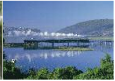
Outeniqua Choo Tjoe